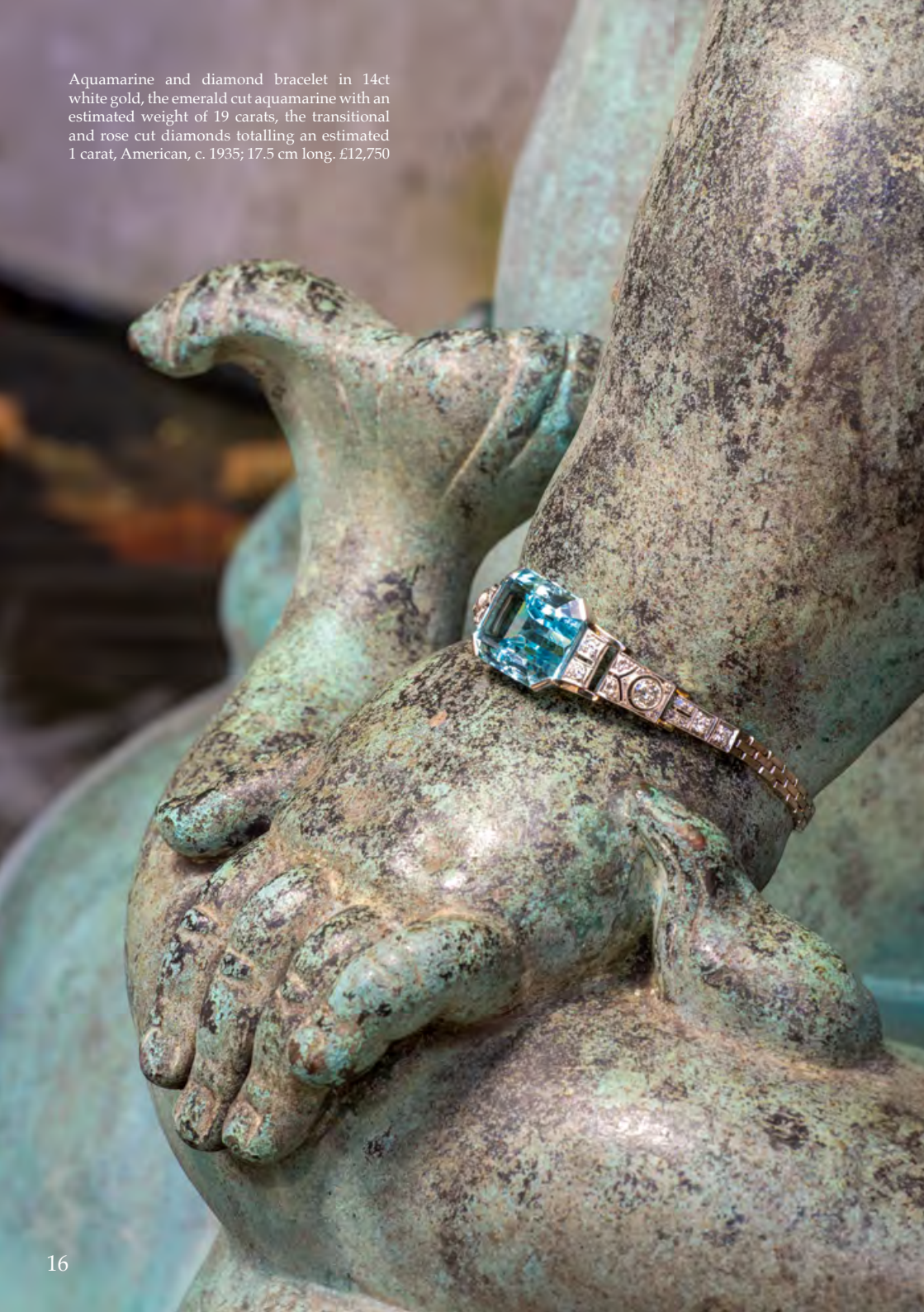
Aquamarine and diamond bracelet in 14ct white gold, the emerald cut aquamarine with an estimated weight of 19 carats, the transitional and rose cut diamonds totalling an estimated 1 carat, American, c. 1935; 17.5 cm long, £12,750