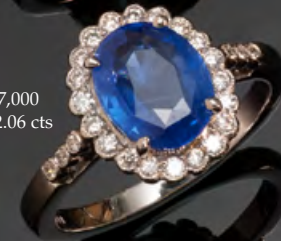
£7,000 S: 2.06 cts