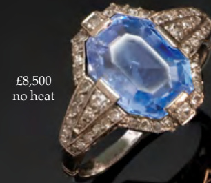
£8,500 no heat