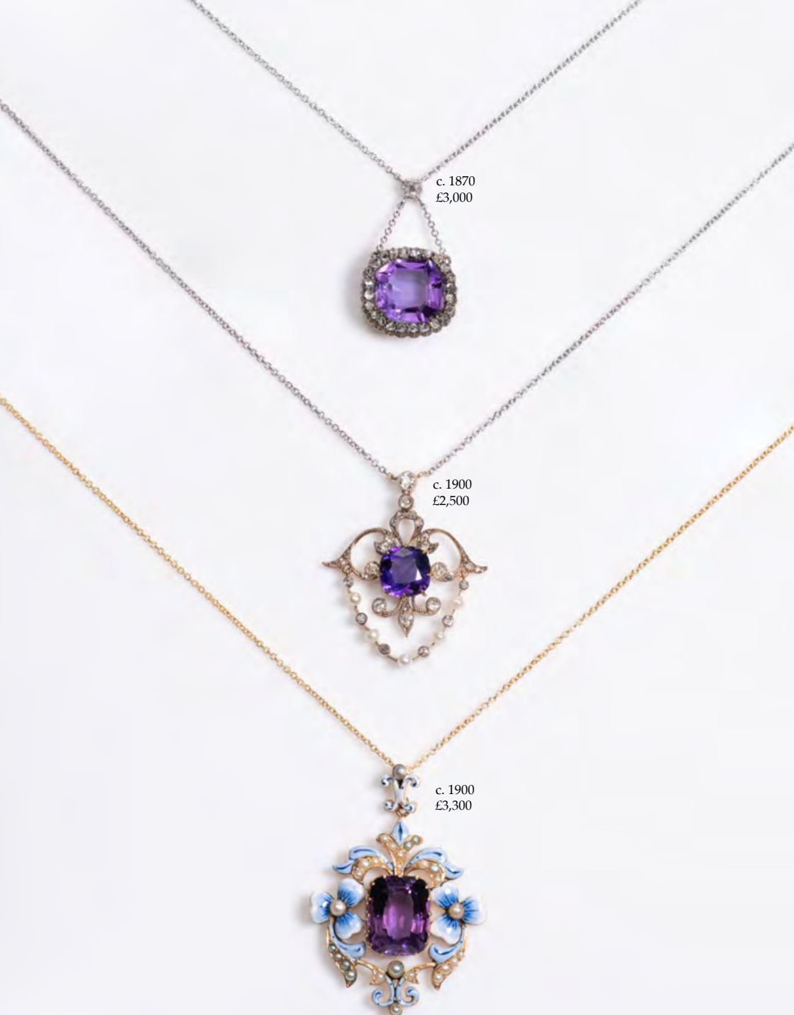
c. 1870 £3,000