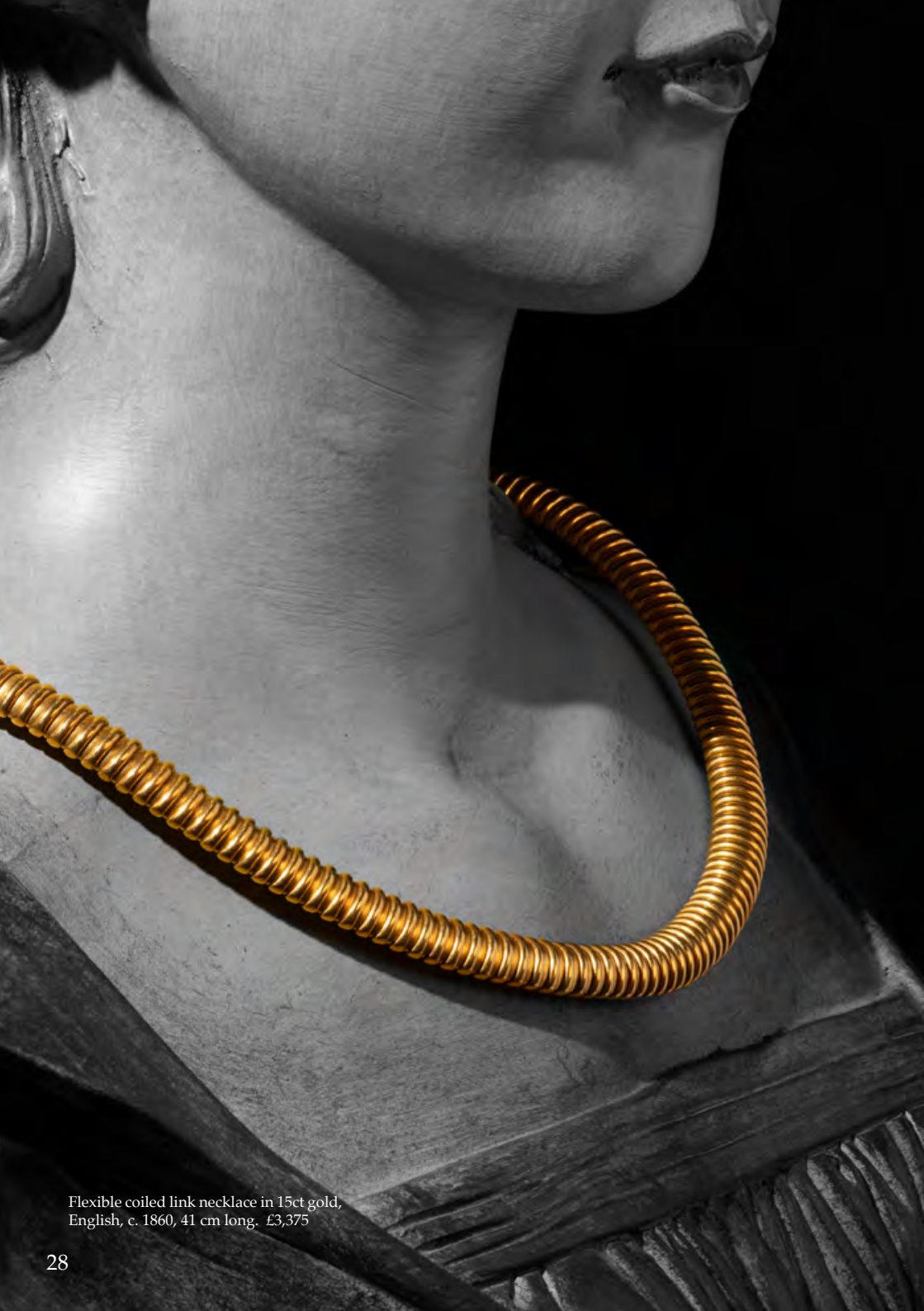
Flexible coiled link necklace in 15ct gold, English, c. 1860, 41 cm long. £3,375