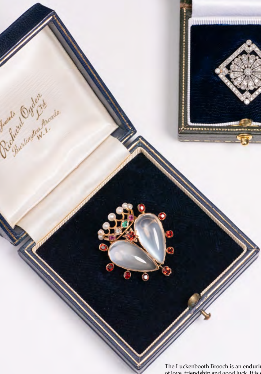
Victorian Luckenbooth gold brooch set with two pear shape moonstones and hessonite garnets, English, c. 1875, 34 by 33 mm. £3,500

The Luckenbooth Brooch is an enduring Scottish symbol of love, friendship and good luck. It is strongly associated with Edinburgh and named after the locked booths that were the early shops where such brooches would have been sold. The design is often associated with Mary Queen of Scots since the two hearts form the letter 'M'.