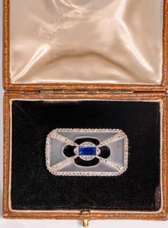
Sapphire and rose cut diamond set crystal plaque brooch in platinum, English, c. 1910, 37 by 21.5 mm. £2,950