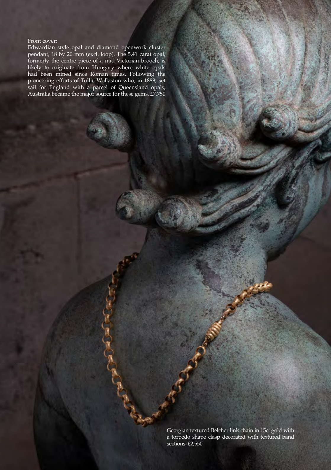
Georgian textured Belcher link chain in 15ct gold with a torpedo shape clasp decorated with textured band sections. £2,550

Edwardian style opal and diamond openwork cluster pendant, 18 by 20 mm (excl. loop). The 5.41 carat opal, formerly the centre piece of a mid-Victorian brooch, is likely to originate from Hungary where white opals had been mined since Roman times. Following the pioneering efforts of Tullie Wollaston who, in 1889, set sail for England with a parcel of Queensland opals, Australia became the major source for these gems. £7,750