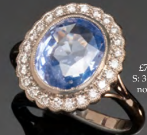
£7,750 S: 3.16 cts no heat