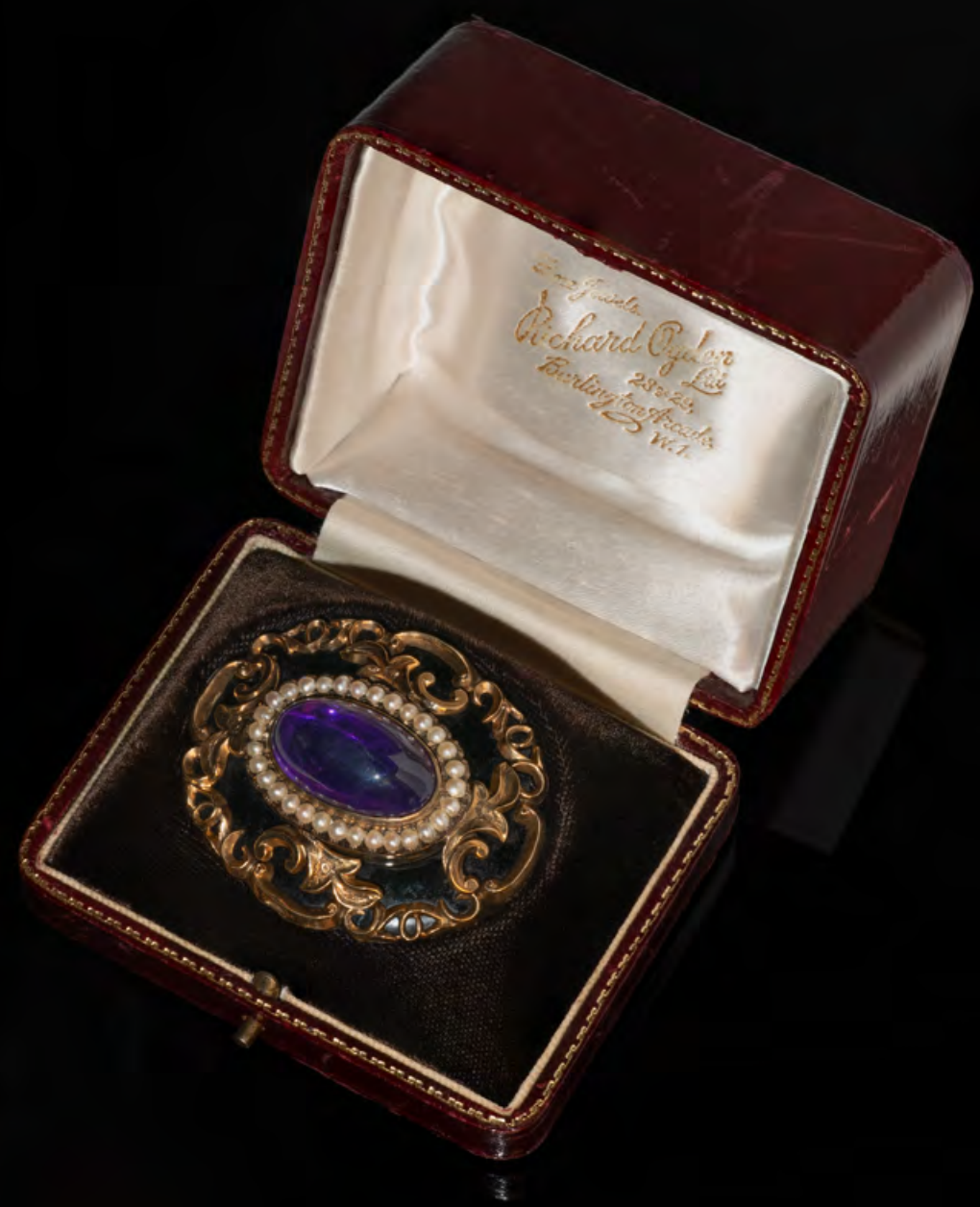
Victorian cabochon amethyst and pearl brooch in 15ct gold, the black enamel with applied gold scroll decoration, the reverse engraved with the date 1856, 58 by 48 mm. £1,250