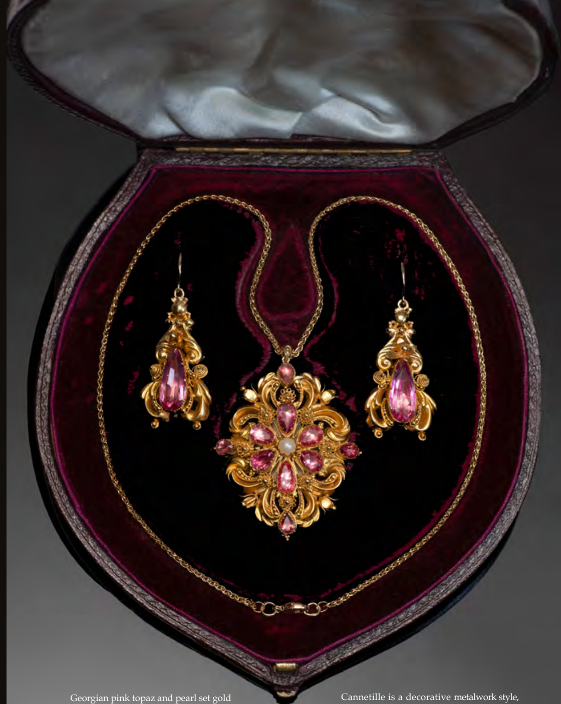
Georgian pink topaz and pearl set gold cannetille suite comprising a pendant locket and a pair of drop earrings. £5,500

Cannetille is a decorative metalwork style, originally from embroidery, that uses coiled and twisted gold wire to create intricate scroll and spider-like rosette patterns.