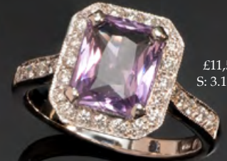
£11,500 S: 3.11 cts