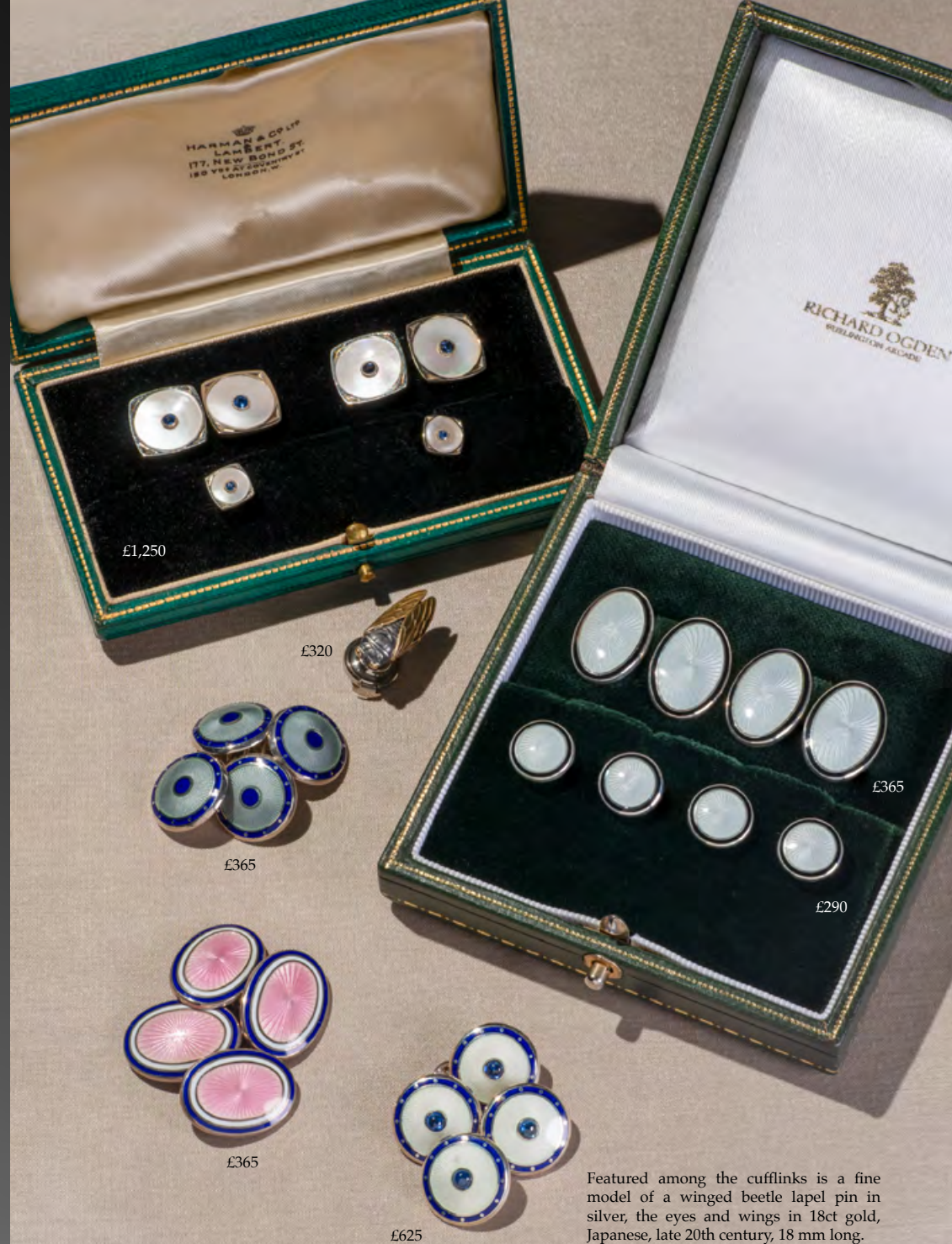
Featured among the cufflinks is a fine model of a winged beetle lapel pin in silver, the eyes and wings in 18ct gold, Japanese, late 20th century, 18 mm long.