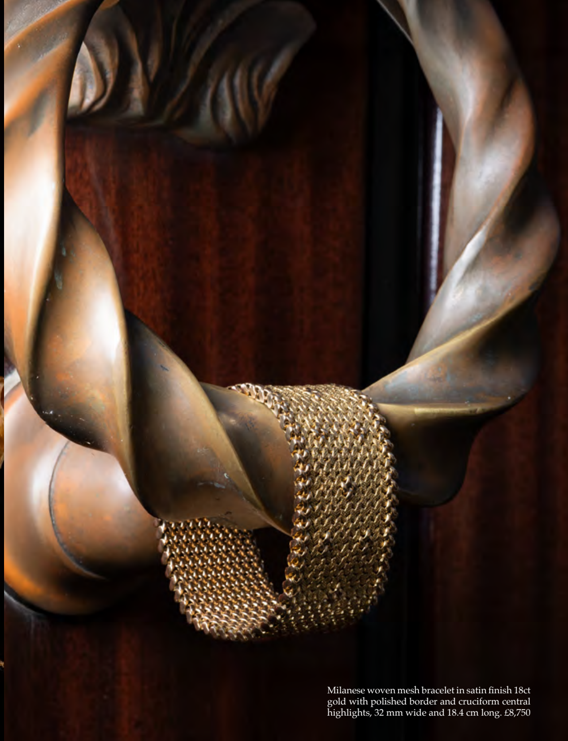
Milanese woven mesh bracelet in satin finish 18ct gold with polished border and cruciform central highlights, 32 mm wide and 18.4 cm long, £8,750