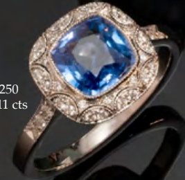
£5,250 S: 2.11 cts