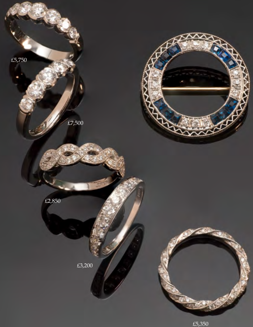
Sapphire and diamond circle brooch in platinum, English, c. 1925, 26 mm in diameter. £2,500