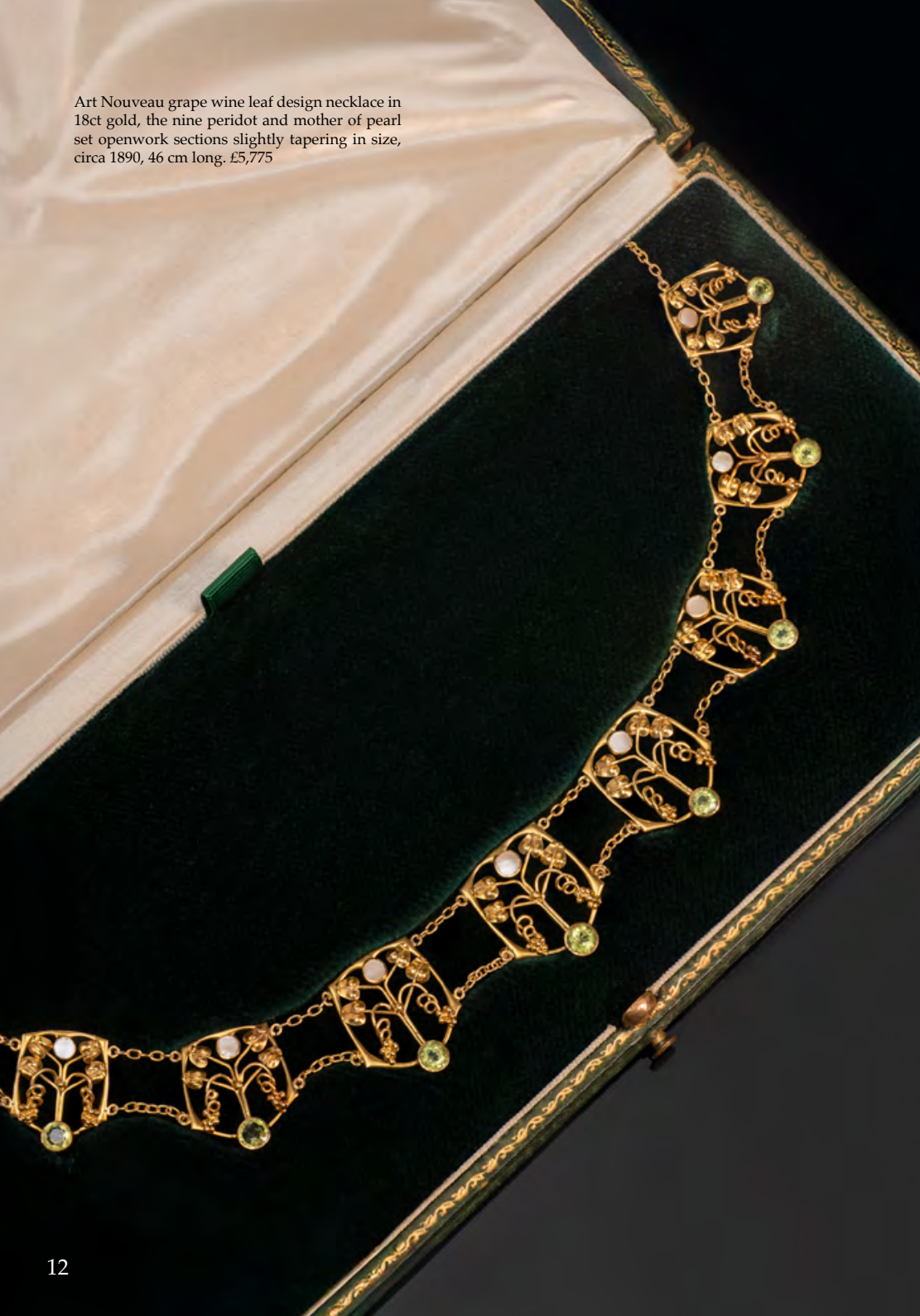
Art Nouveau grape wine leaf design necklace in 18ct gold, the nine peridot and mother of pearl set openwork sections slightly tapering in size, circa 1890, 46 cm long, £5,775