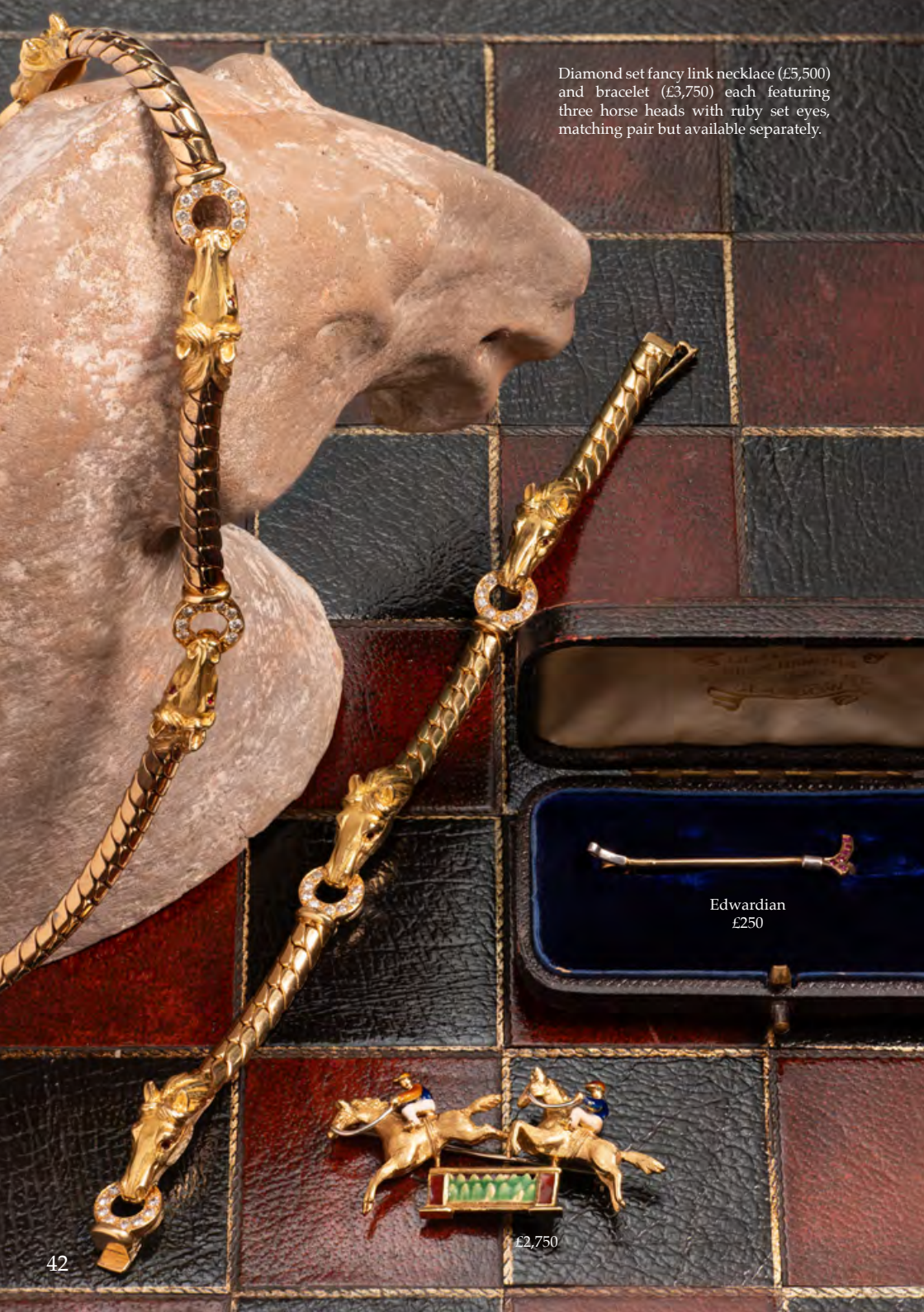
Diamond set fancy link necklace (£5,500) and bracelet (£3,750) each featuring three horse heads with ruby set eyes, matching pair but available separately.