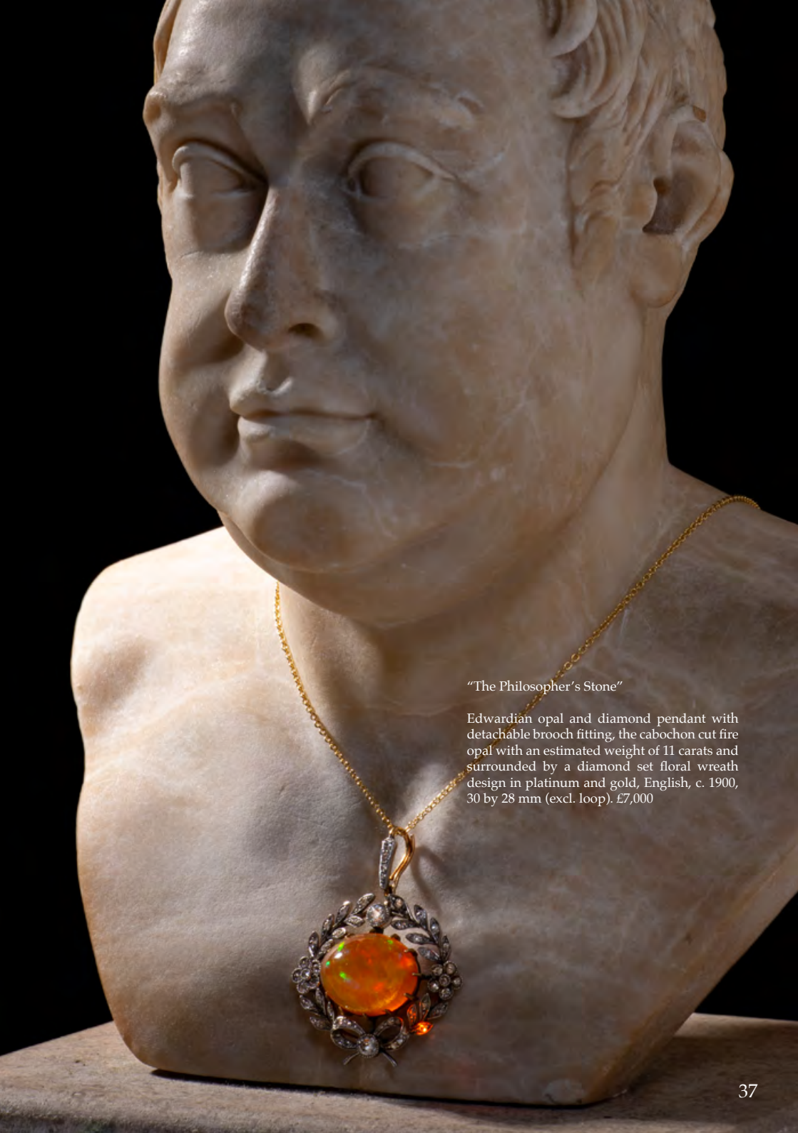
"The Philosopher's Stone"