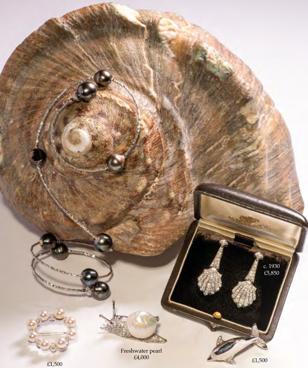
Flexible wrap-around bracelet in 18ct white gold interspersed with nine black cultured pearls, to be worn on the wrist or upper arm. £2,475