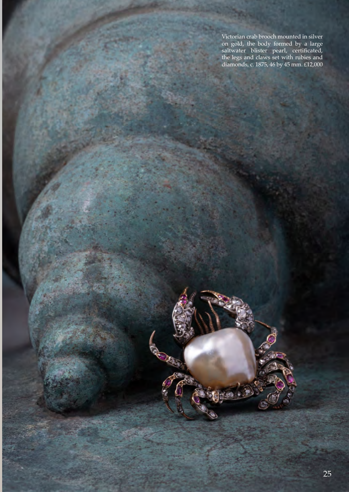
Victorian crab brooch mounted in silver on gold, the body formed by a large saltwater blister pearl, certificated, the legs and claws set with rubies and diamonds, c. 1875, 46 by 45 mm. £12,000