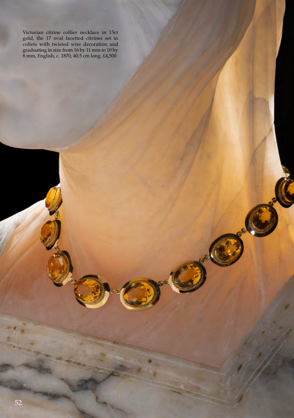
Victorian citrine collier necklace in 15ct gold, the 17 oval faceted citrines set in collets with twisted wire decoration and graduating in size from 16 by 11 mm to 10 by 8 mm, English, c. 1870, 40.5 cm long. £4,500