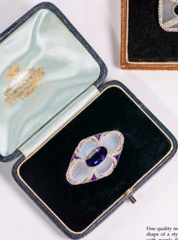
Fine quality moonstone and amethyst brooch in the shape of a stylised flowerhead, the oval amethyst with purple flashes, the carved moonstone petals framed by graduating rose diamonds and calibr  cut amethysts, English, c. 1910, 36 by 22 mm. £12,500