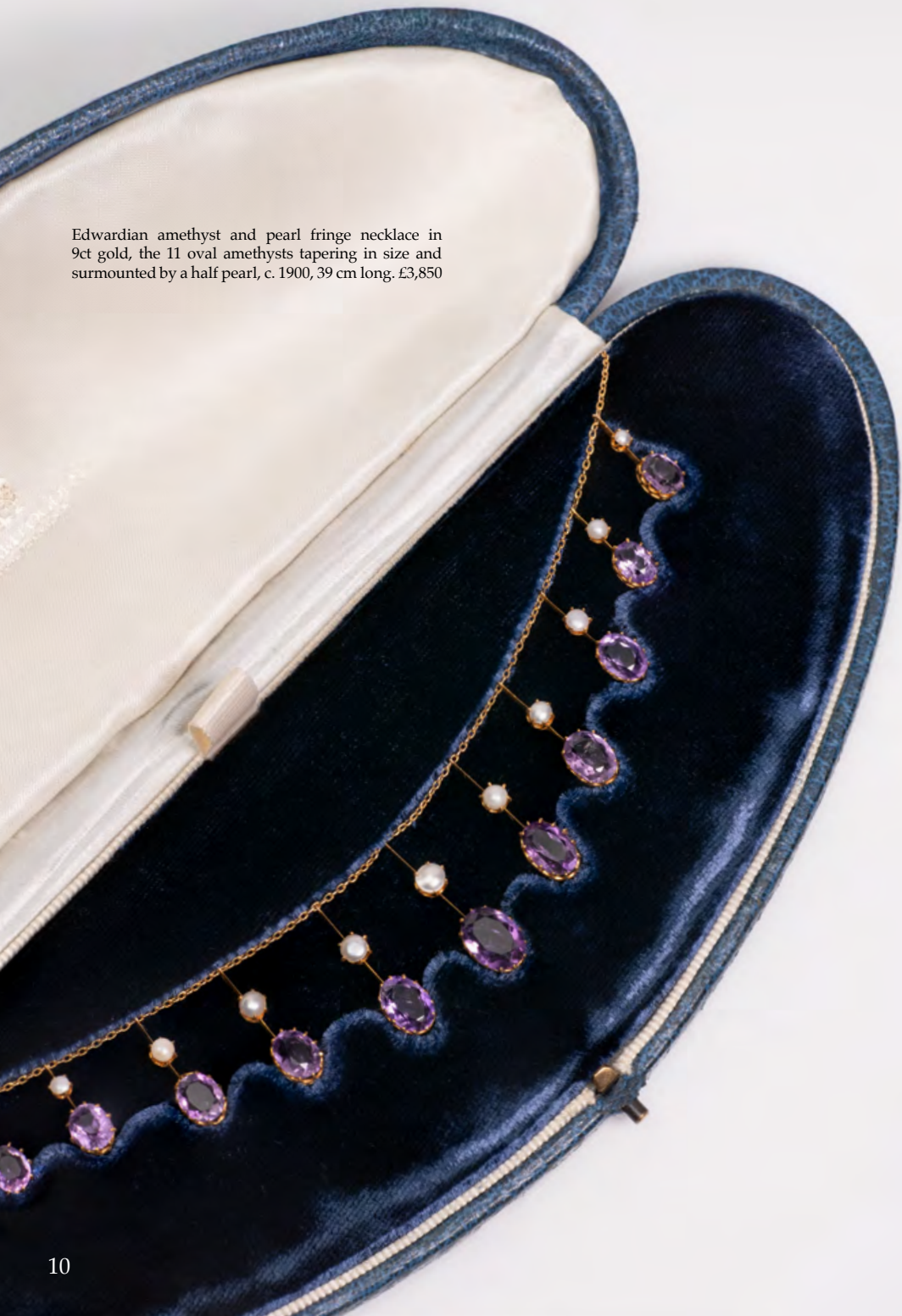
Edwardian amethyst and pearl fringe necklace in 9ct gold, the 11 oval amethysts tapering in size and surmounted by a half pearl, c. 1900, 39 cm long. £3,850