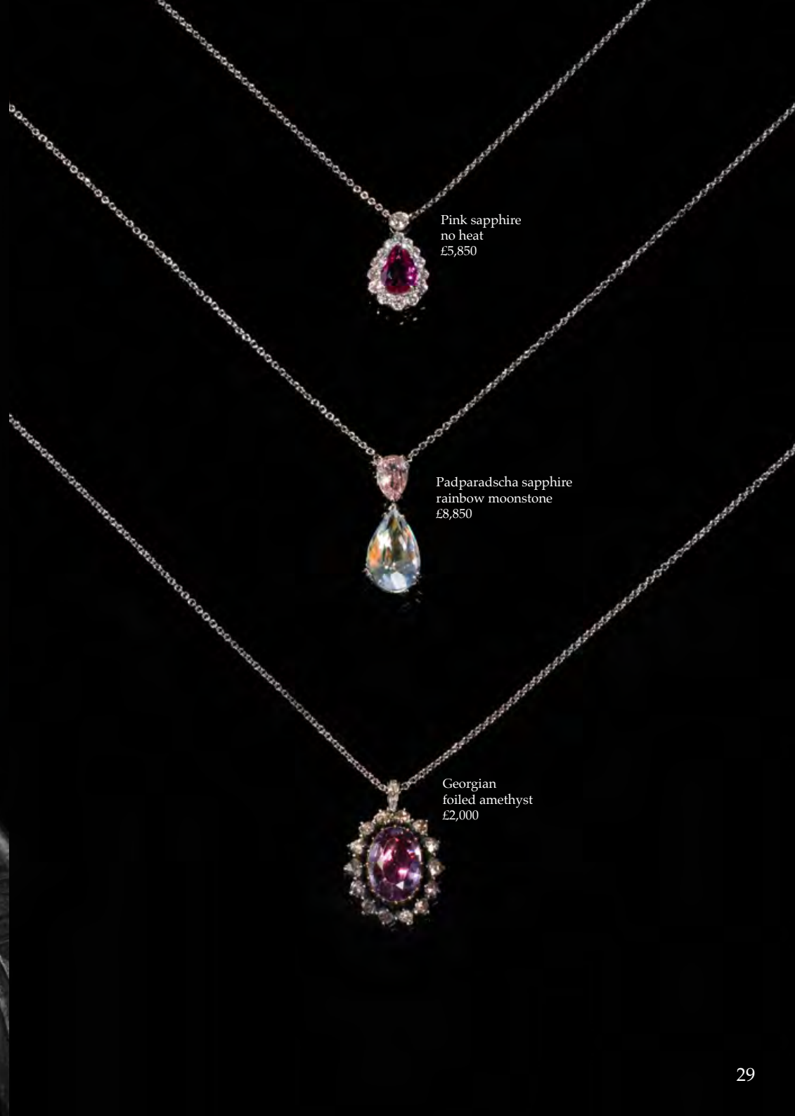
Pink sapphire no heat £5,850